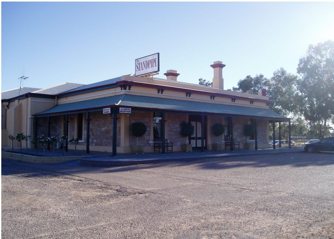
The StandPipe Hotel circa 2003 Click here to find it on Google Maps